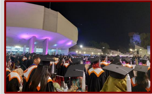
NED's 30 th Convocation; Navigating New Waters: Fresh Graduates, Hopes & Concerns