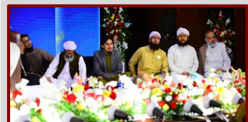
Eid Milad Un Nabi (SAWW) EVENT