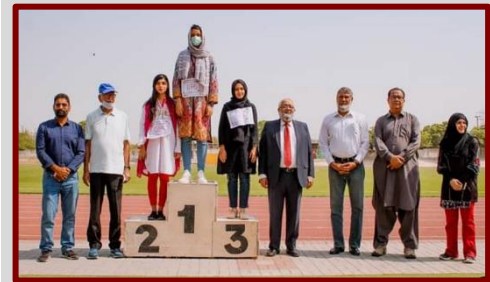
Run the Extra Mile-NED's Very Own Running Marathon