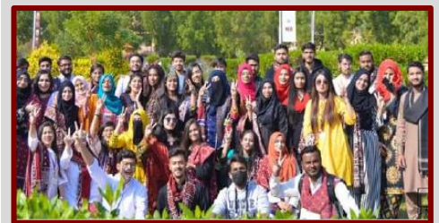
United by Cultural Festivities